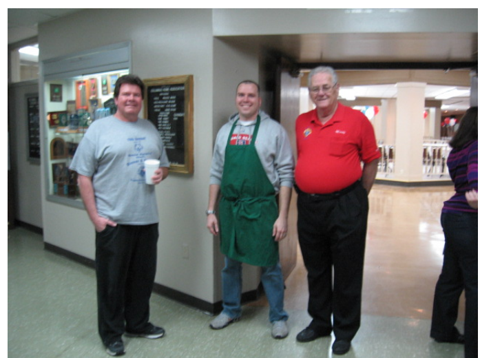
Get ready . . . . here they come!!